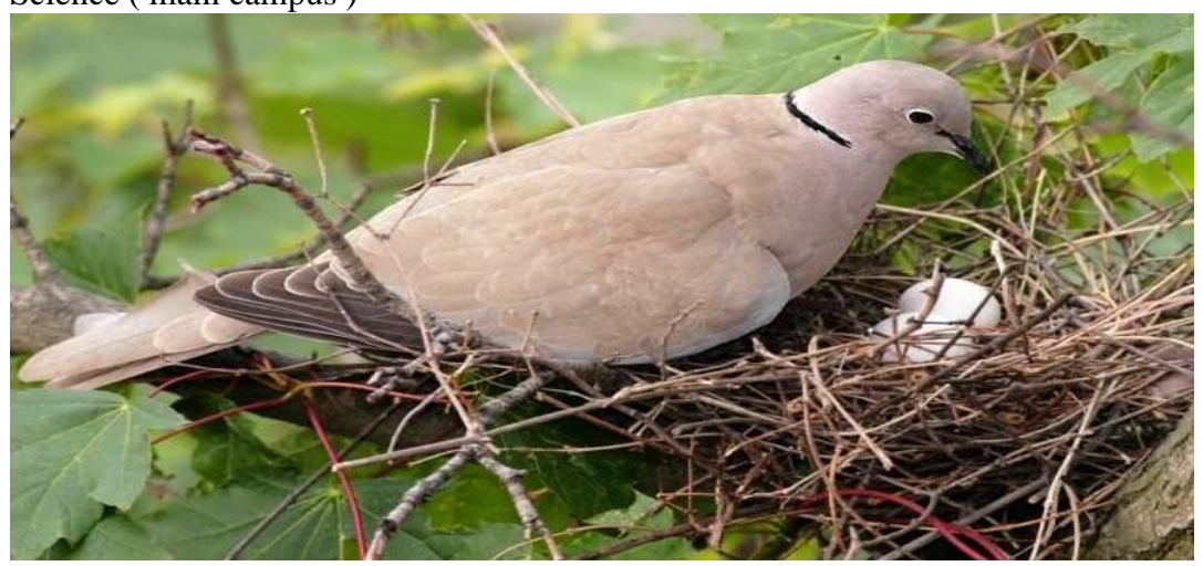
Class- ii Subject – Elemenntary Science Chapter-3 ( The Animal Kingdom) Prepared by- Sadia Binta Basher Science ( main campus )

How a baby bird grows up : when a baby birds hatch, they are blind and have no feathers. The parents look after the babies. They feed the babies and keep them warm. Soon the baby birds grow feathers and they learn how to fly. Then they leave their nest.