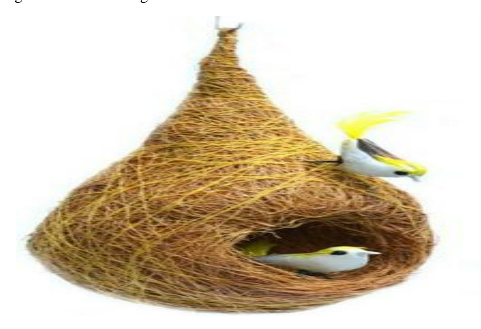
Figure: Birds nest

Nest : Most birds build nests. Some nests are made high up in trees. Others are made on the ground or in buildings.