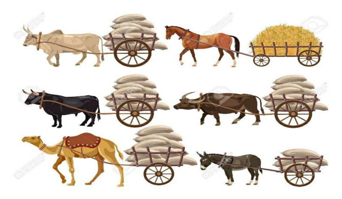
Figure: Beasts of burden

Beasts of burden : some animals carry loads for us. They are called beasts of burden. Donkey, horse, bullocks etc. are beasts of burdens.